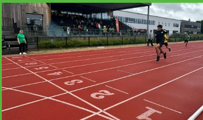
Year 9 starting their tug of war event in sports day and Year 8 boys 100m crossing the finish line.