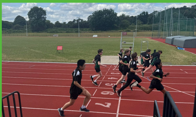
Year 7 cricket team before their match against Woking High and Students practicing sprinting as their athletics training in lessons.