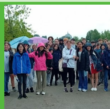
Year 10 students during their work experience at Beard construction, Teachers 'renting' Sixth Form students for the day as part of RAG week and Our year 8 & 9 students on a history trip to Normandy.

Please click on the icons to follow us on social media