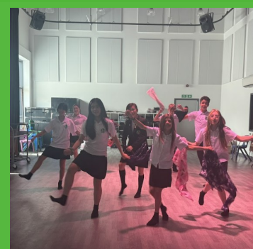
Students making balloon powered vehicles in science club, Year 11's enjoying their end of year prom and Year 8 participating in their musical theatre topic in Drama class.

Please click on the icons to follow us on social media