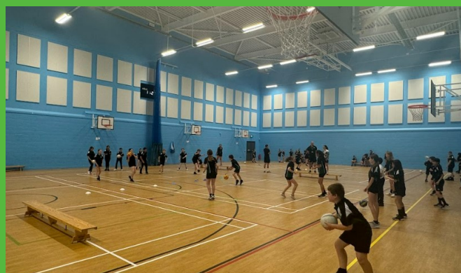
Year 7 and 8 competing in the house dodgeball tournament winning points ahead of sports day.