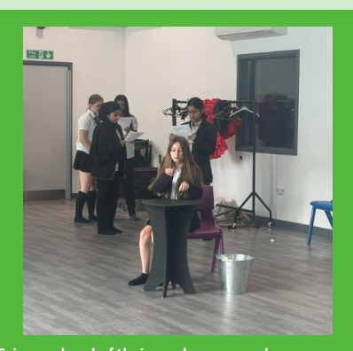
Some of the pieces selected and auctioned in the Charity Art auction last Friday, Year 10's revising hard in Science ahead of their mock exams and Year 7 performing an extract from Grimm's fairy tales in Drama

Please click on the icons to follow us on social media